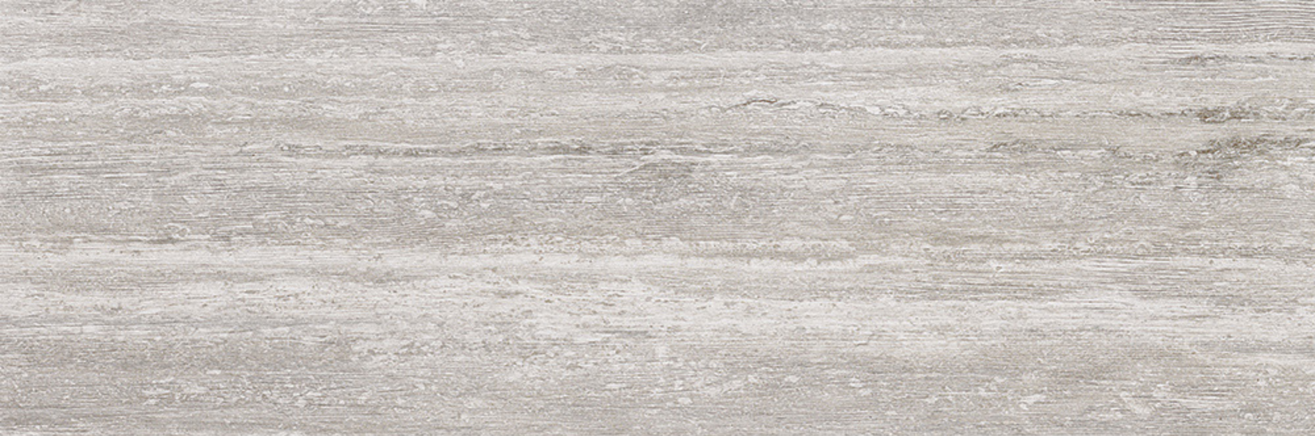
TREK SILVER - 60 X 180 cm